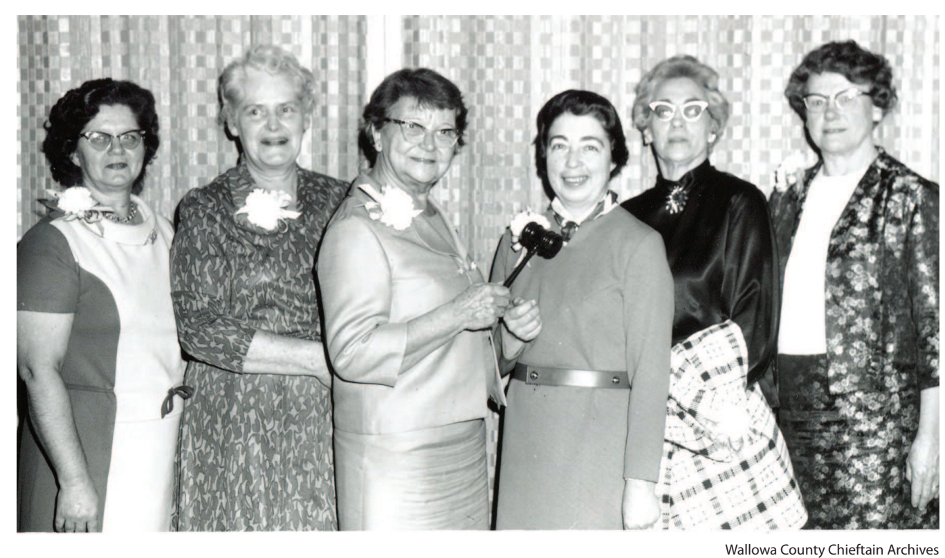
Social women of Wallowa County.

The opening dance of the 1949 season will be held at Edelweiss inn at the head of Wallowa lake. The road and parking grounds are said to