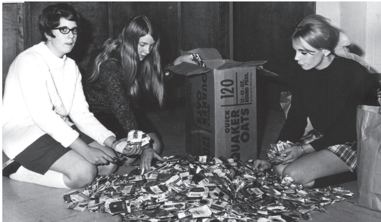
Wallowa student photo lab, year unknown

A roaring Chinook yesterday morning wrecked buildings and blew down trees in a wide stretch of country around Joseph and Enterprise. The most serious damage was done to the Joseph school building, the south part of which was half demolished. The railroad