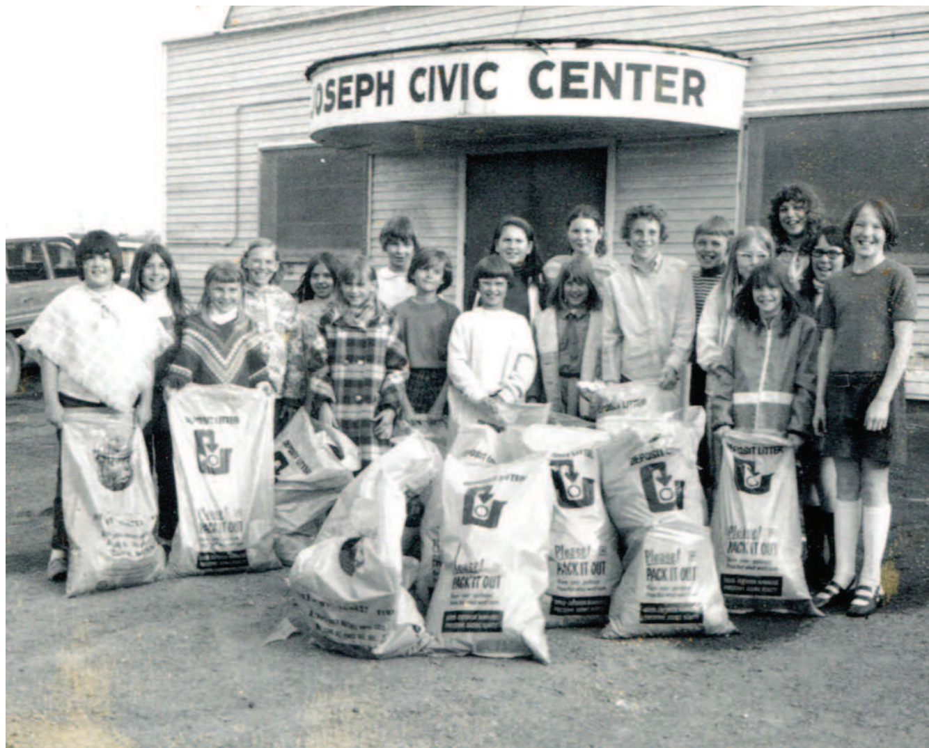
Children pose in front of the Joseph Civic Center at an unknown date.