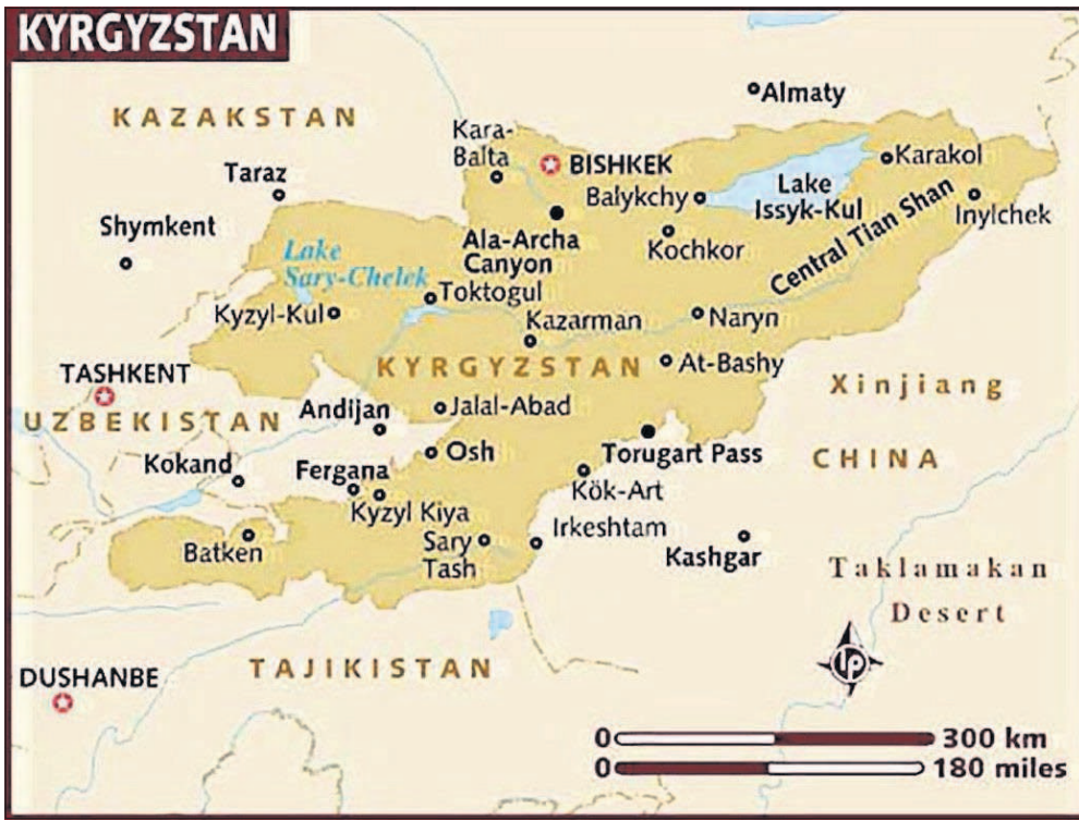
Kazakhstan is located in Central Asia and is a former republic of the USSR. It is bound by Russia to the north, the Caspian Sea to the west and southwest, Turkmenistan, Uzbekistan and Kyrgyzstan to the south and China to the southeast.

ICAPS works internationally with individuals, communities and institutions to improve the sustainability of pastoral systems and improve