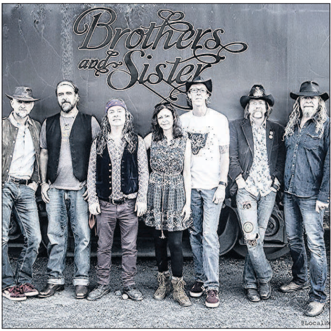
Brothers and Sister will perform at OK Theatre in downtown Enterprise Thursday.