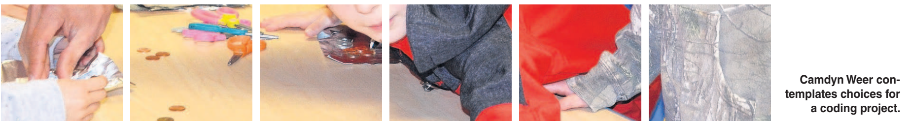
Camdyn Weer contemplates choices for a coding project.