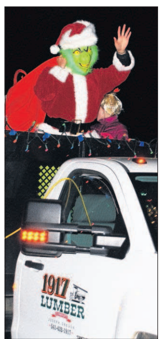
Above right, The Grinch, a fictional character created by Dr. Seuss, attempted to steal Christmas in Joseph Nov. 25 but was apprehended and made to ride on the 1917 Lumber float during the Jingle Through Joseph Parade.