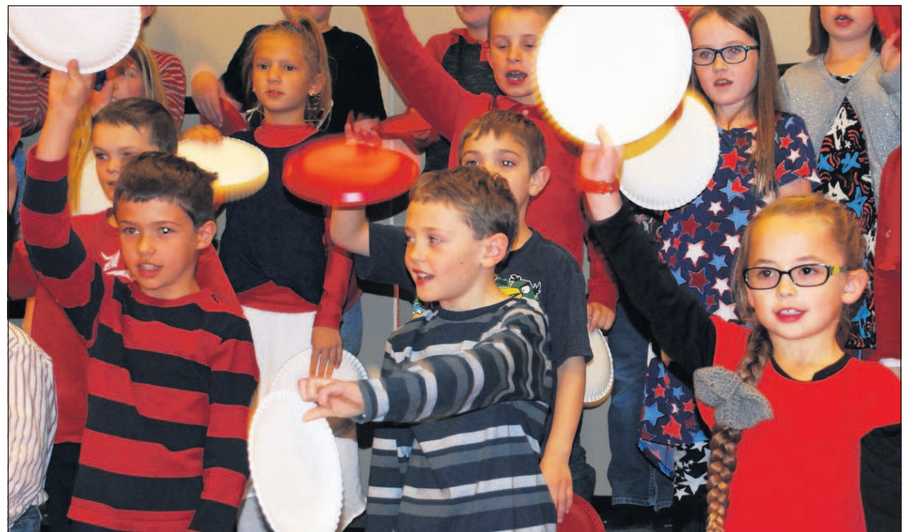
Enterprise Elementary second-graders used paper plates to convey their message during "A Salute to Our Veterans" Nov. 9 at the EHS gym.