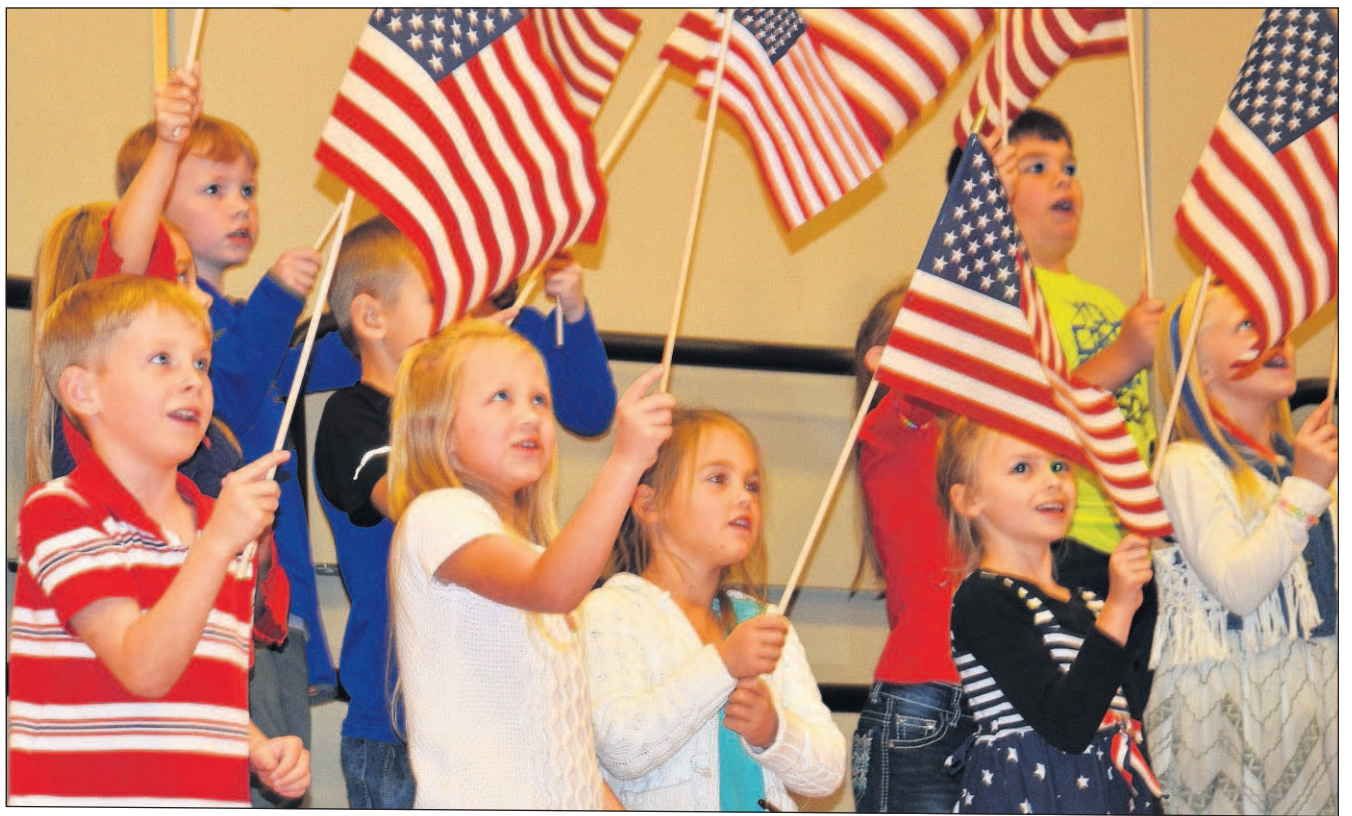
Enterprise Elementary first-graders sang "You're a Grand Old Flag" and waved American flags as part of their performance in "A Salute to Our Veterans" Nov. 9 at the EHS gym.