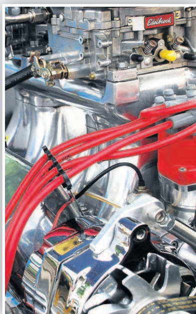
Car engines were shined to their sharpest for the 2017 Oregon Mountain Cruise in Joseph.