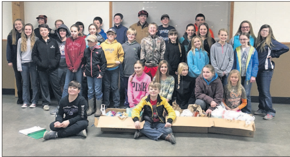
Area 4-H students donated 3,000 pounds of food to local banks.