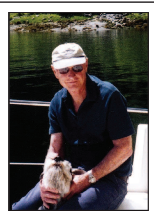
Harry W. Olds May 16, 1934 -January 7, 2017

Twenty-three citizens marched through downtown Enterprise on Sunday in support of the Affordable Care Act. They met with the county commissioners on Tuesday at 9 am to ask them to contact Rep. Walden and to express their support of protecting his constituents' right to affordable healthcare and to stop the full repeal of the Affordable Care Act.