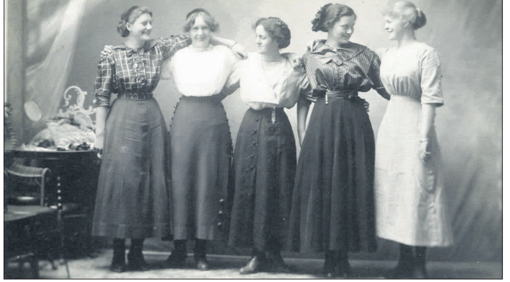
From the Chieftain archive

News from Troy: Friday night, December 28, there was a Christmas dance at the Troy hotel, attended by a large number of young people As is usually the case at such gatherings, everything was moved out of the main room in the hotel to give space for the occasion.