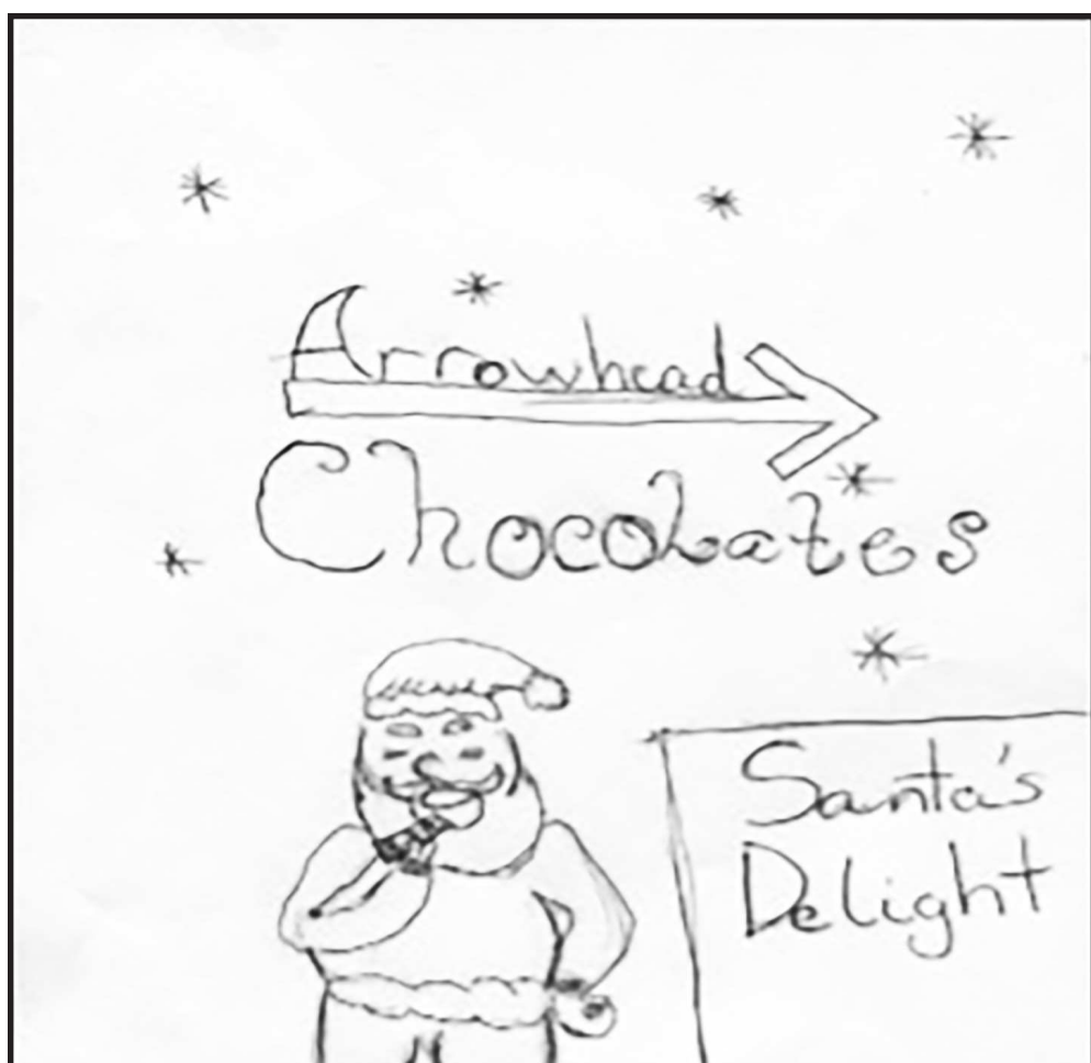
Talia Aase 5th Grade • Enterprise