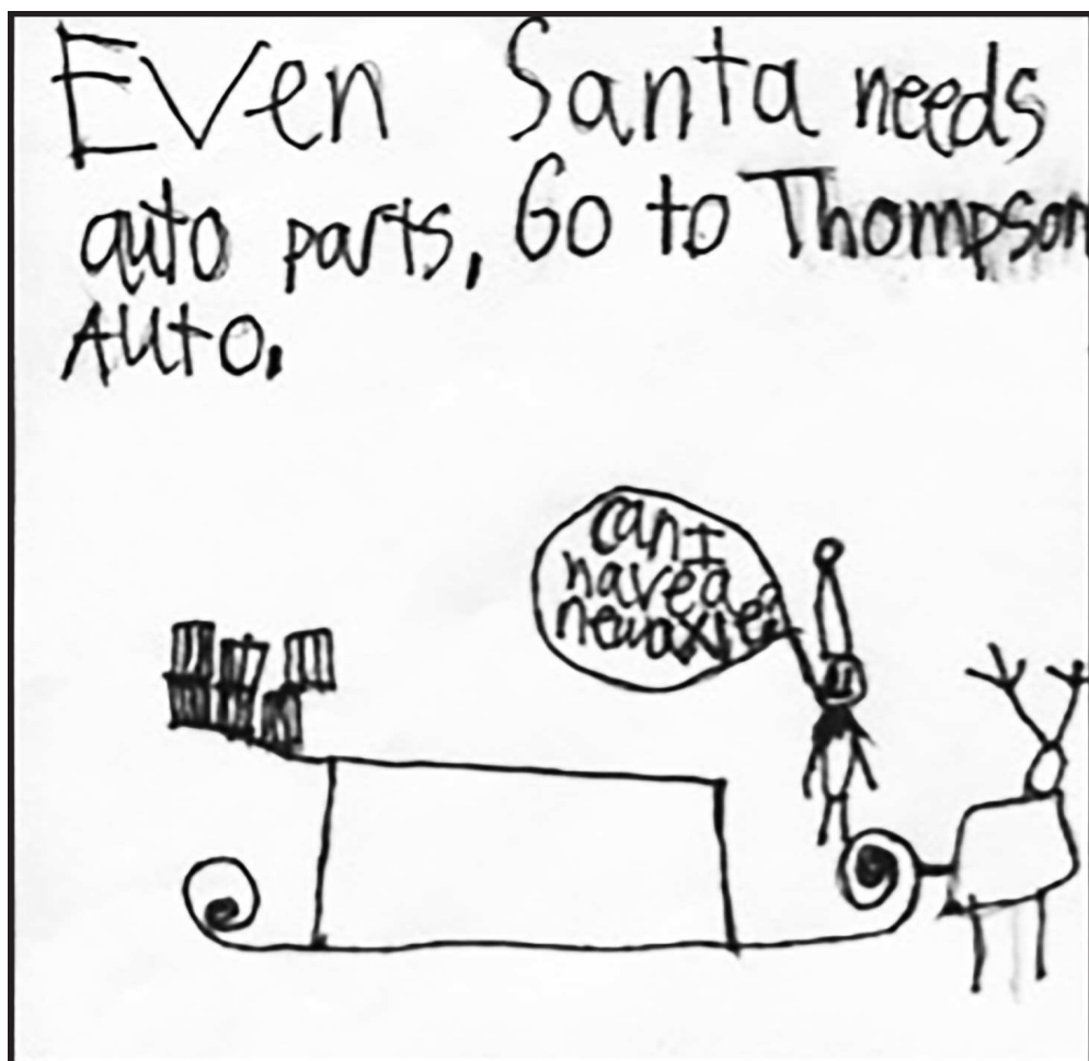
Lane Botts 5th Grade • Enterprise