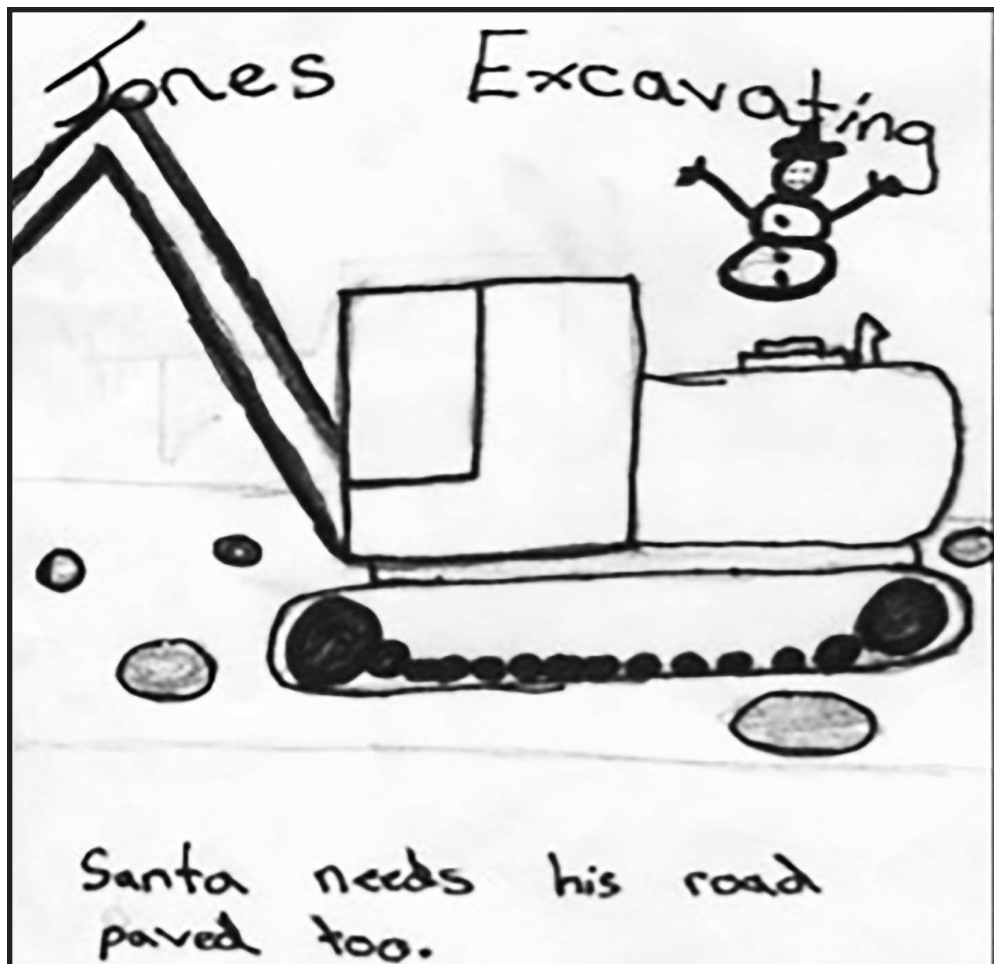
Tegan Evans 5th Grade · Enterprise