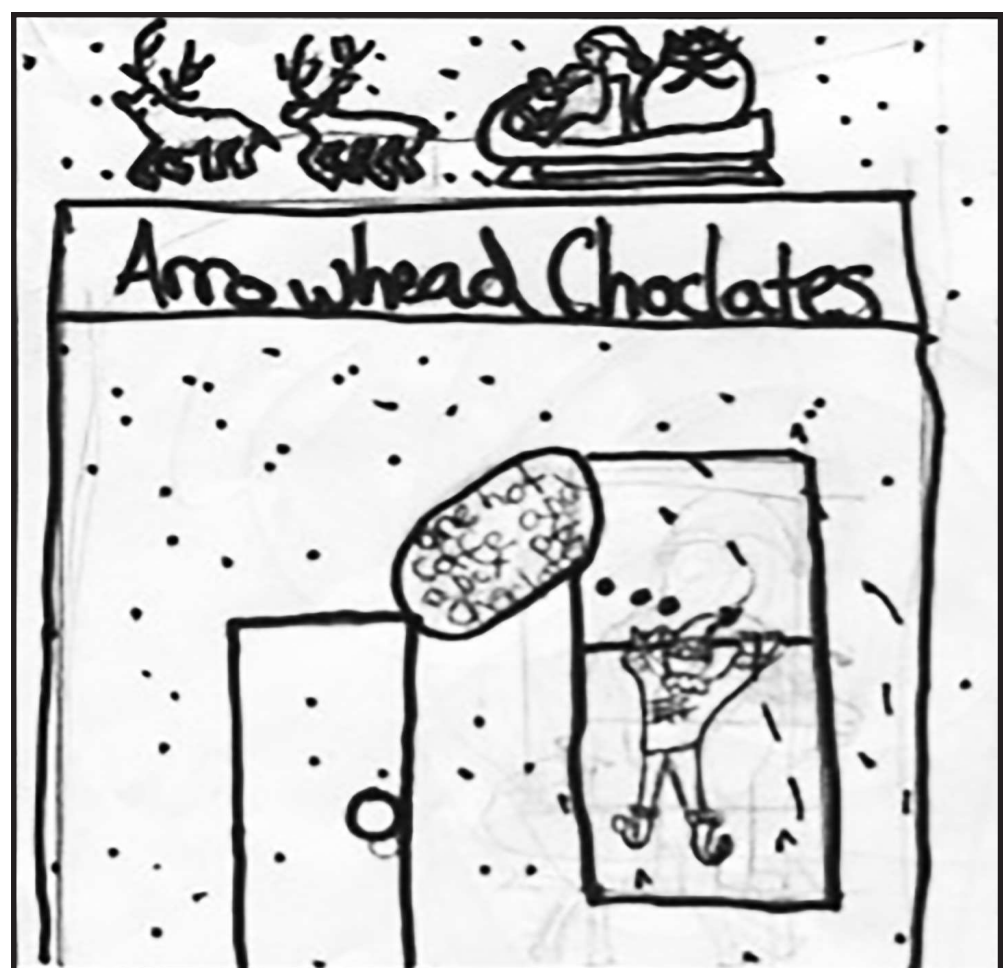
Cecilia April 5th Grade · Wallowa