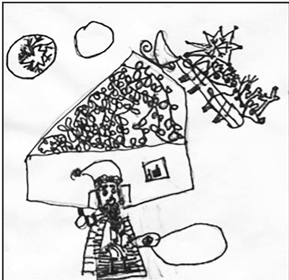
Caleigh 2nd Grade · Wallowa