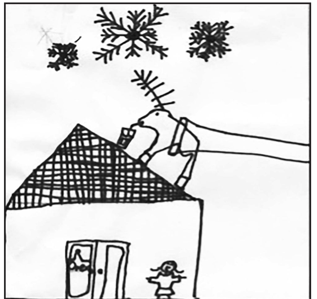
Ella 2nd Grade · Wallowa