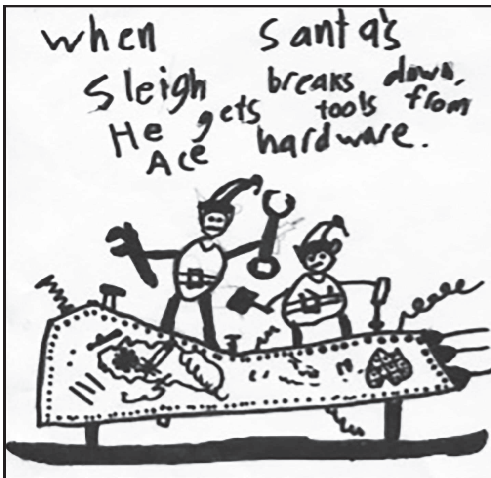
Luke Clinchy 5th Grade • Enterprise