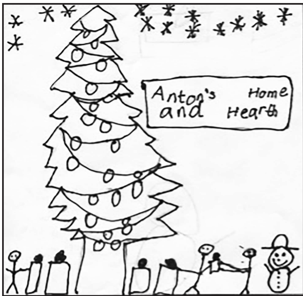
Case Melville 2nd Grade • Enterprise