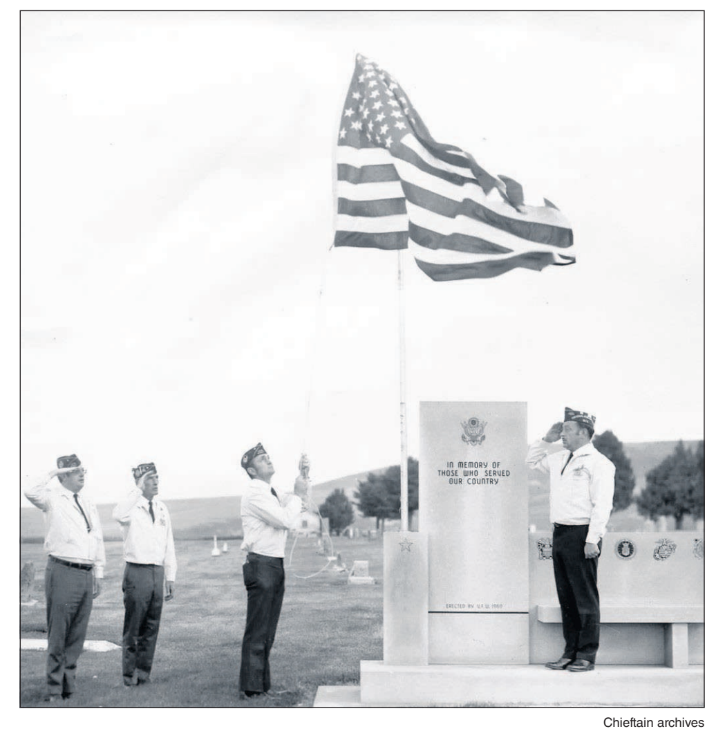
Enterprise Cemetery. Date and names unknown.

both ways and the stay in town into a jollification.