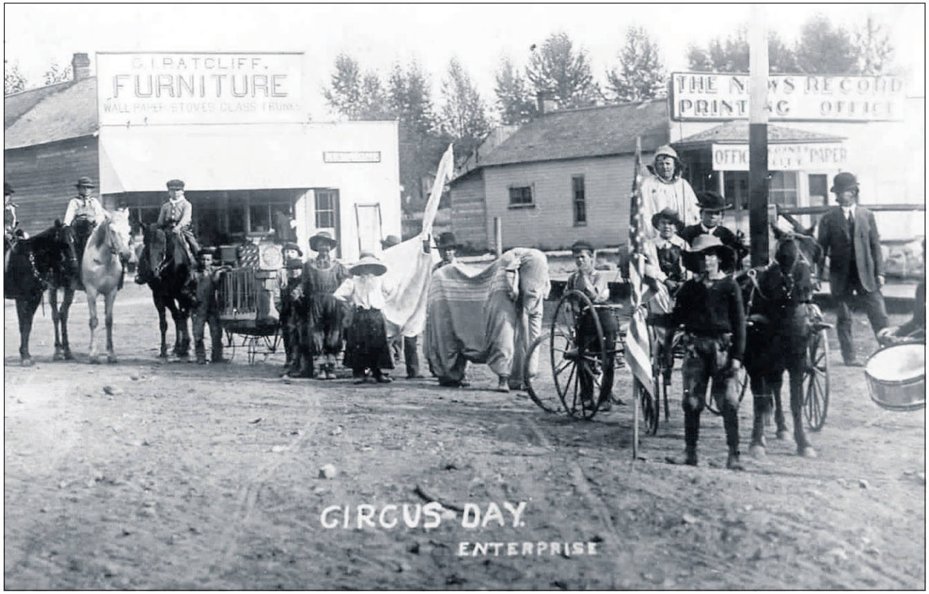
Circus Day in Enterprise. Date unknown.