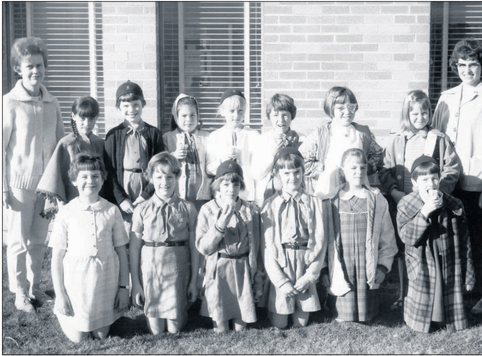
Brownie troop — date, location and names unknown.

• Style tip: That skirts are to be longer will be a great relief to many and a sad blow to the woman with trim ankles. Yes, they are to be but a paltry five inches from the ground, and after the ten we