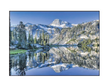
Honorable mention: "Eagle Cap, Mirror Lake," by Ellen Morris Bishop