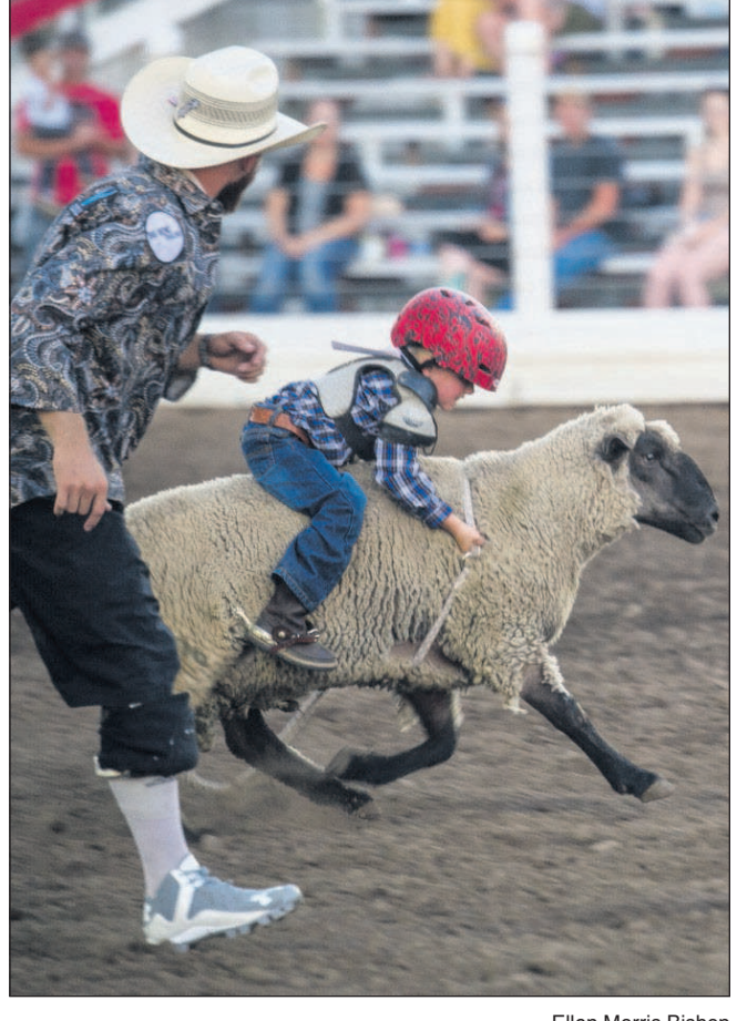
A youngster holds on for dear life during the mutton busting competition on Wednesday night.

The overall performances energized the crowd to a point of constant roaring after a number of stellar performances spread across the events, particularly with the announcement of Kolbaba's triumph in the bull riding after that final event ended. Kolba-