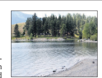
The explosive device was underwater discovered the small channel (background, right) that

other explosives were used to initiate detonation. However, he agreed that it certainly was more powerful than an M80 and closer to a stick of dynamite.