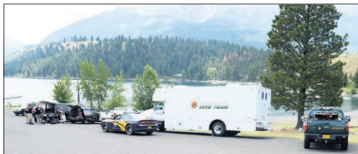
Local, state and federal law enforcement officials gathered to remove an explosive device from the water near the public beach area at the north end of Wallowa Lake on Friday.