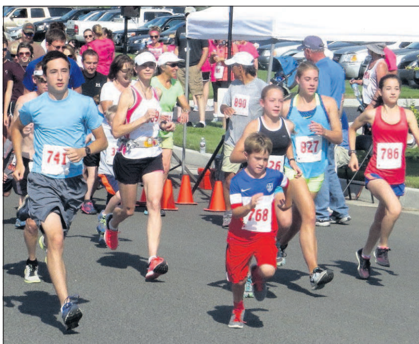
The start of the 2015 Amy Hafer Race for Awareness.

Two local organizations have been raising money through their own efforts to donate to Wallowa Memorial Hos-