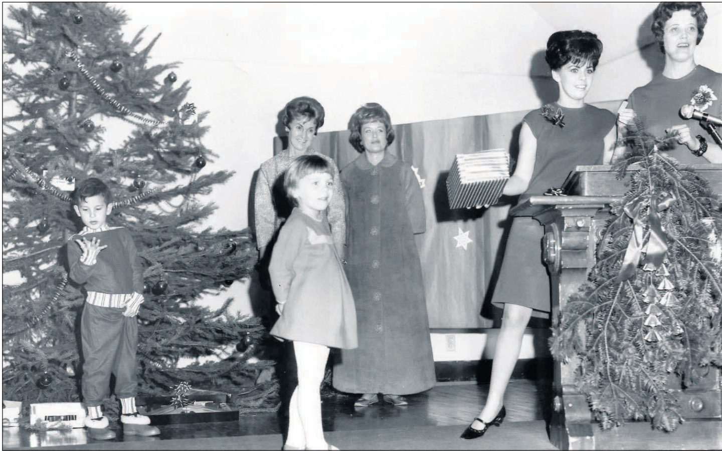
Chieftain archives Festivities of a Christmas past. Place, names and date unknown.

• A need for 54 Christmas baskets to be sent to needy