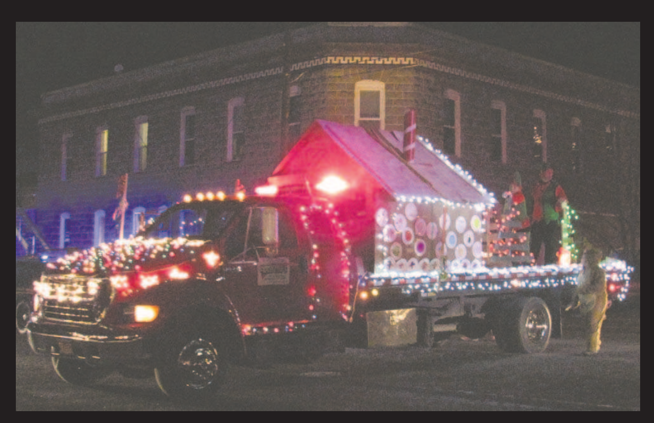
The 2015 Winterfest Christmas Lights Parade.