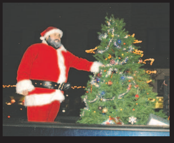
Santa takes a ride in the Winterfest Parade.