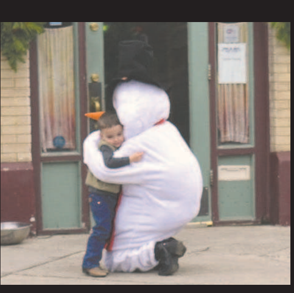
A boy gets a hug from Frosty on Saturday afternoon outside Gypsy Java.