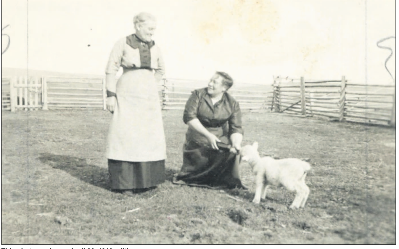
This photo ran in our April 20, 1916 edition.

Showing at the People's Theatre: "Blighted Lives" with