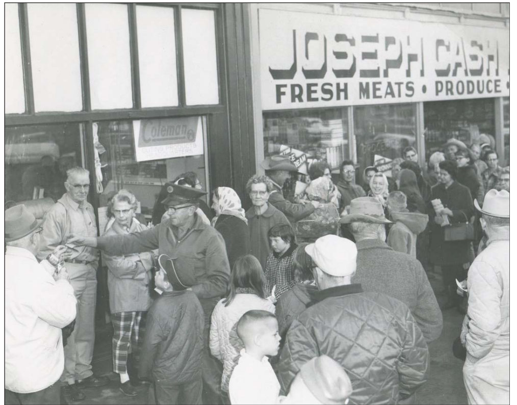
There's something going on in this old photo, taken probably 50 or more years ago, of a crowd gathered in front of the old Joseph Cash Market, but we're not sure what it is. Do any of our readers know what the occasion might have been?