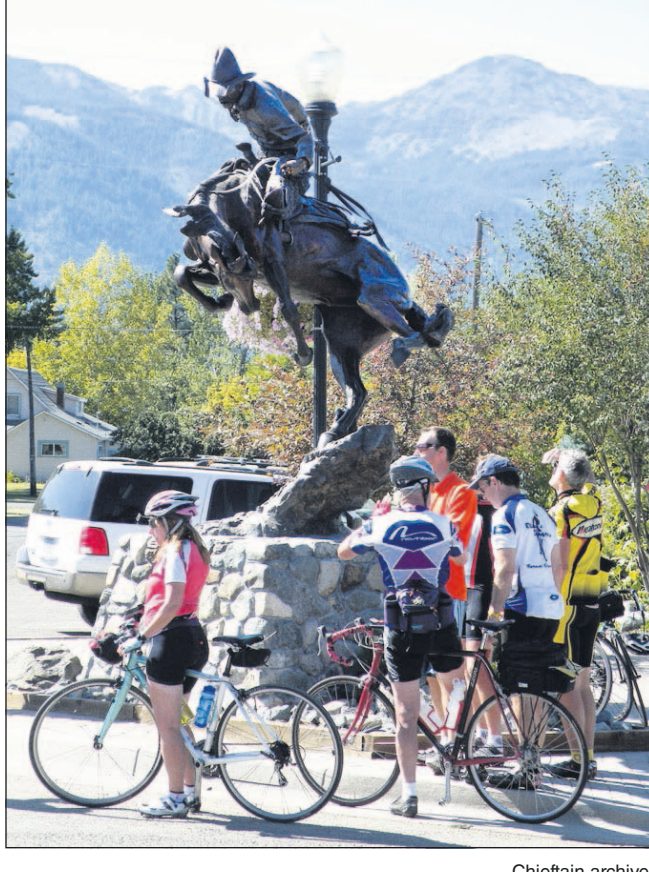
Cycle Oregon riders enjoy some time in Joseph during the 2008 ride.

Thanks to all who came out to listen to the great music at Juniper Jam! The snow capped peaks showed their majesty to all who attended the sweetest little music festival in Eastern Oregon.