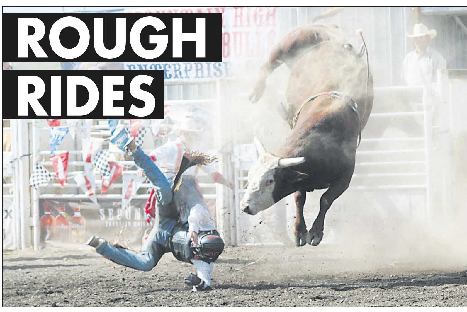
It was not all peaches and cream in the riding events. The bull gets the best of the rider on this go-round.