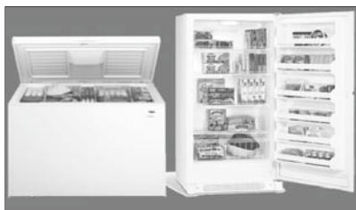
Amana & Crosley brands

Come in today for our special selection of: Dishwashers • Microwaves • Stoves Washers & Dryers • Refrigerators • Freezers