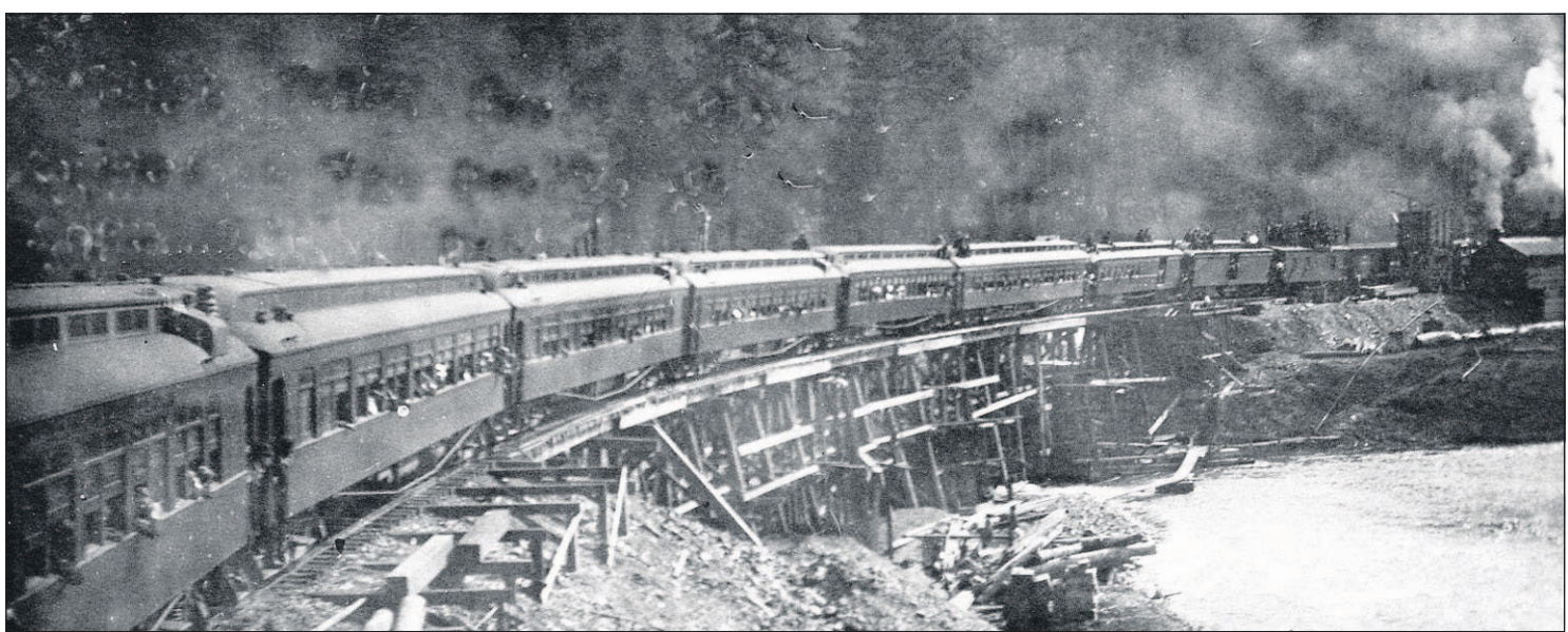
A short piece of text submitted with this photo declares this to be the "first train for Wallowa County," crossing the bridge at Minam at the junction of the Wallowa and Grande Ronde rivers, Sept. 20, 1908.