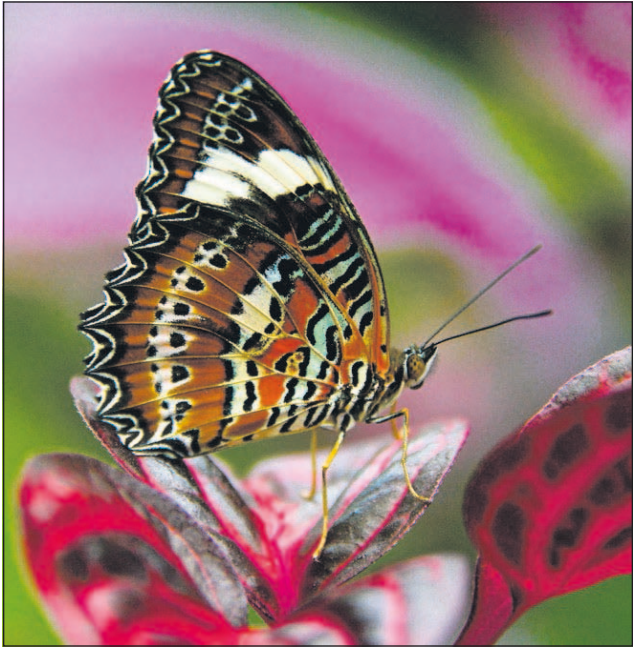
Photo by Vin Searles “Butterfly Beauty” was the Judges’ Choice first place selection. Photographer Vin Searles lives in Salem.

all total of 463 in 2014, a record year for submissions, but 2015’s participation level nonetheless ranks as second-highest in the contest’s history. Judges from the Wallowa Valley Photo Club determined one set of winners — first through third places plus an honorable mention in both the Adult and Student divisions — and the public cast votes online at the Chieftain’s website to pick first through third