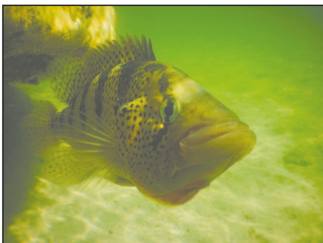
"Mayan Cichlid" tied for third place in the People's Choice Adult Division.