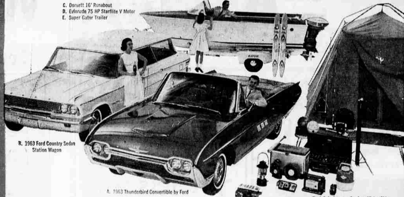
C. Dorsett 16' Runabout D. Evinrude 75 HP Starlite V Motor E. Super Gator Trailer