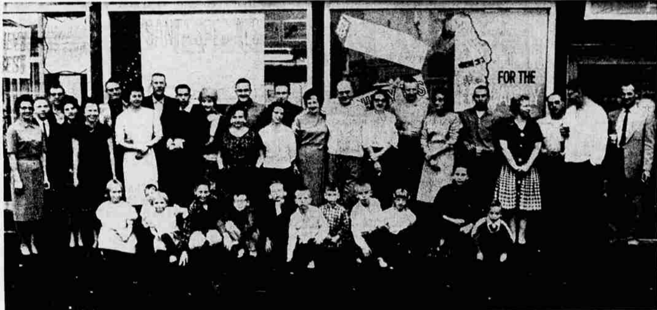
Ben Jacques employees and their families... 1962 Christmas Party

Ben Jacques Chevrolet, Inc., its employees and their families thank the people of Central Oregon for their loyal patronage and warm friendship... and wish one and all a very, very