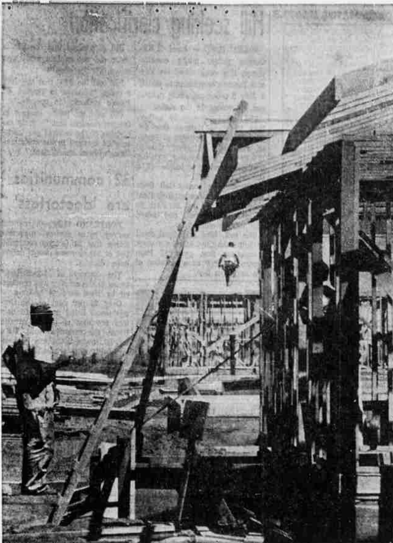
GOING UP FAST — Construction activity is booming in the new North Pilot Bridge Addition off Jones Road in Bend. Western Development Co. has 46 new homes scheduled.

EIGHT DWARFS? MEMPHIS, Tenn. (UPI) — The Memphis Children's Theater will present the story of Snow White and the Eight Dwarfs. A spokesman explained the casting committee selected one dwarf too many and expanded the cast to include "the sleepy twins" rather than "the slumberer's feelings."