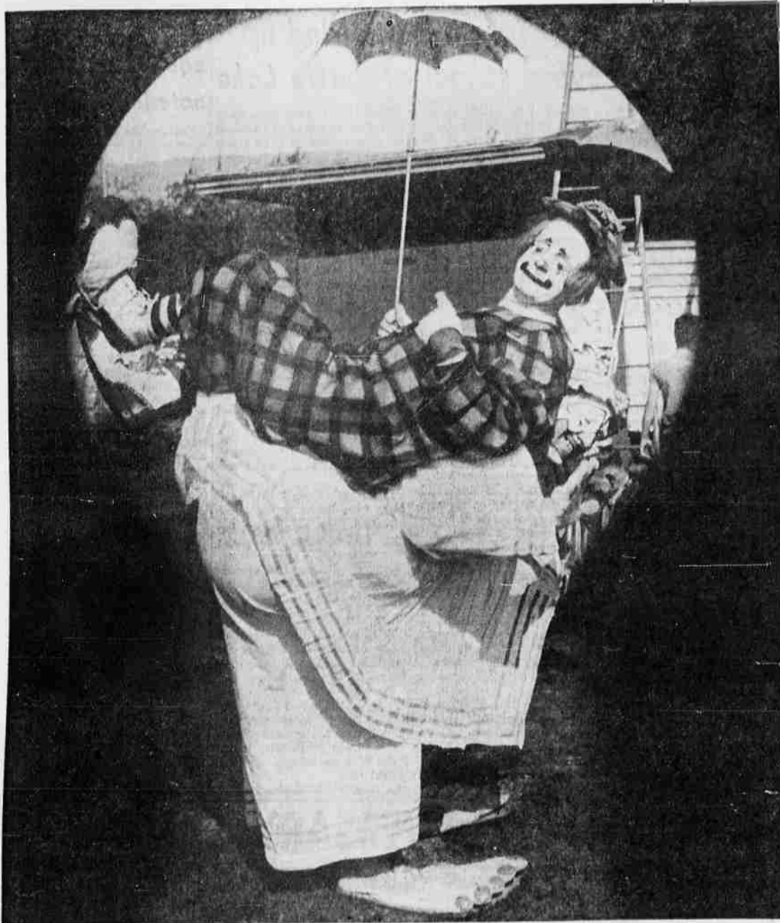
A LOOK AT THE CIRCUS —Peeping through the circus keyhole in Bend on July 2 under auspices of the Bend Rotary Club. These are just two of the many clowns of the circus who will keep the Bend audience laughing.