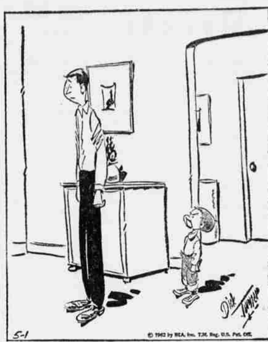
"I thought you said an education was worth money, Pop! It sure isn't worth anything at Smitty's Candyland!"