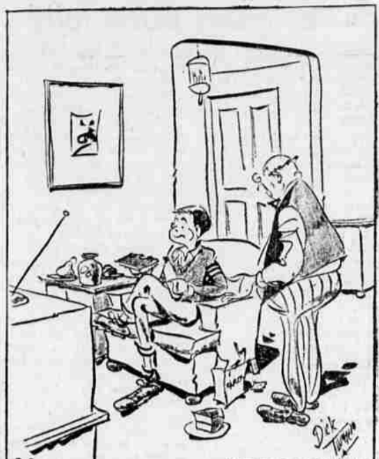
"It isn't natural for a boy not to have a girl friend and raid HER father's refrigerator!"