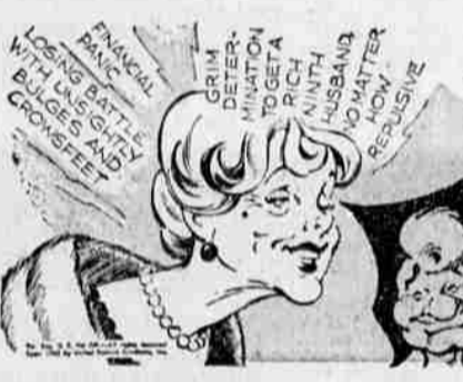
REX MORGAN, M.D.