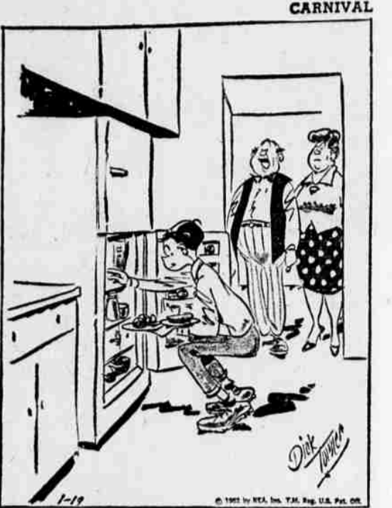
"To watch him eat you'd never guess we could have a food shortage in this country, would you?"

NOTICE OF EXECUTOR'S SALE OF REAL PROPERTY No. 2407 IN THE DISTRICT COURT OF THE STATE OF OREGON FOR THE COUNTY OF DESCHUTES.