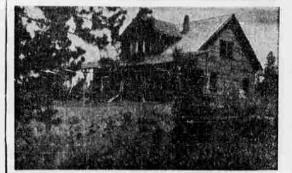
AREA LANDMARK RAZED—A pioneer building that saw service in two different towns, Pringle Falls and Bend, has been razed by the City of Bend, to clear a parking space. Top: picture of the building while it served as a hotel at Pringle Falls, in early days. Below: Building as it appeared on its site near Pioneer Park, at the Portland Avenue-Hill Street location in Bend. The building was torn down on Wednesday.