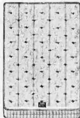
Bigger . . . Queen-size Beautyrest 5-inches longer and 6-inches wider than regular size mattress. Choose normal or extra firm with tufted or new quilted cover. Set of mattress and matching box spring . . . $199.50