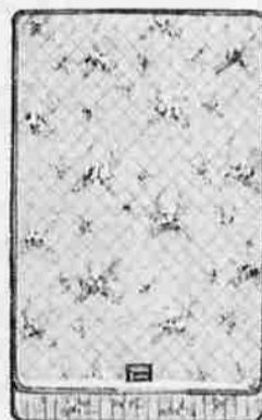
Big . . . Long Box Beautyrest 5-inches longer than regular size mattress. In twin or double bed widths, normal or extra firm, tufted or new quilted cover. Mattress and matching box spring only . . . $89.50