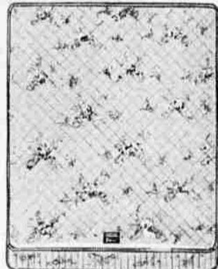
Biggest . . . King-Size Beautyrest 5-inches longer and almost 2-feet wider than standard double-bed mattresses. In normal or extra firm and tufted or new quilted cover models. Set of mattress and 2 twin-size box springs . . . $299.00