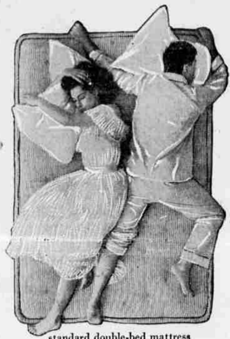
standard double-bed mattress