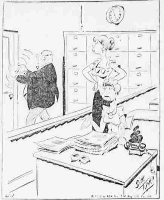
"What happens to me is how he KNOWS when I simply have to get out of the KNO'YS time!"