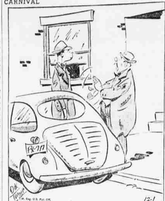
"By George it was tough getting my gear into the trunk, what with the extra motor you carry for the little rascal!"