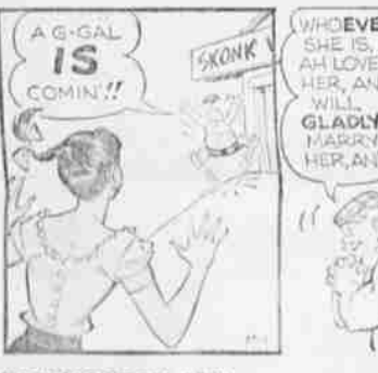
REX MORGAN, M.D.