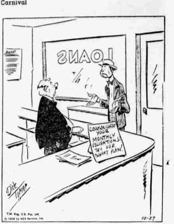
"Your plan isn't practical! I borrow money to consolidate my bills and now the payments are more than I earn!"

They oppose the fundamental principles capable of assuring the peace, progress and the unity of our peoples," he said. America and despotism are absolutely antagonistic terms, he added.