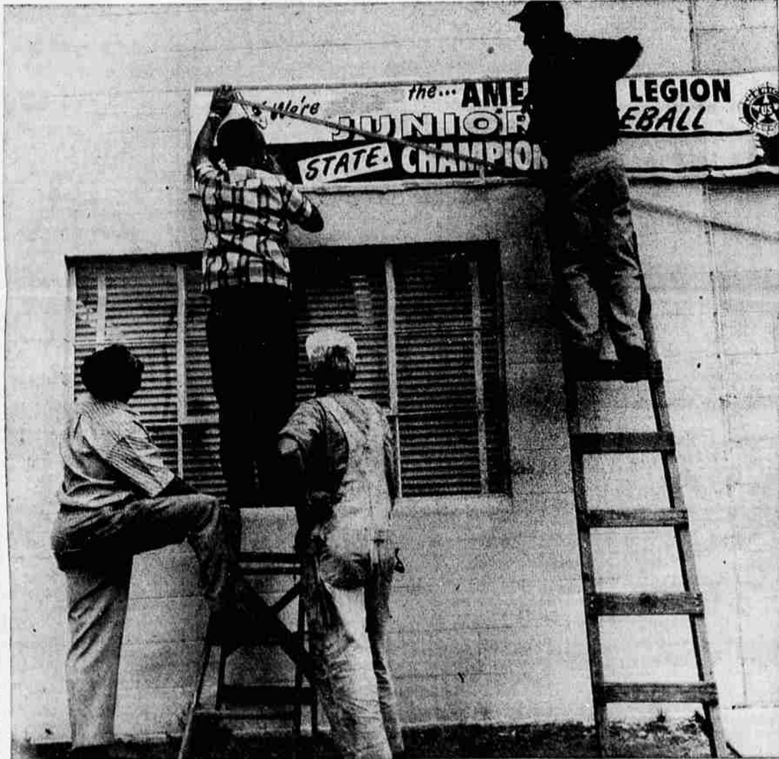
LET'S TELL EVERYONE WE WON IT State Legion Championship banner adorns Murray building