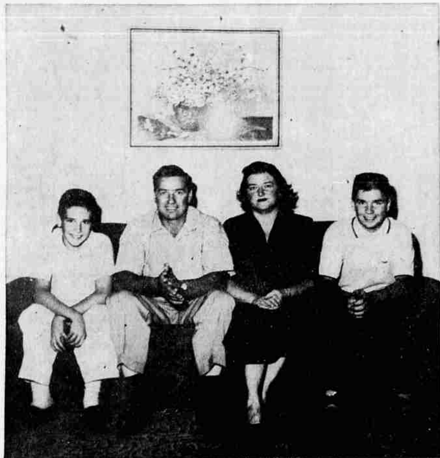
GENNA FAMILY TAKES IT EASY Coach, wife, sons enjoy break at home