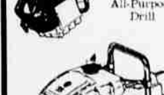
McCulloch model 55