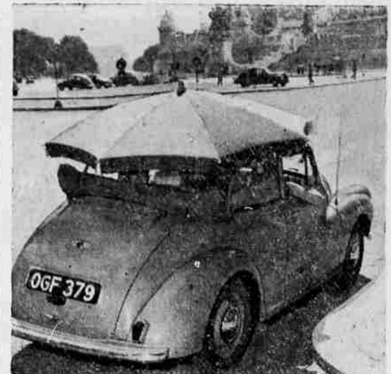
TWICE CONVERTIBLE — Top of this Italian convertible keeps off the sun and rain while motorist is on the road and is designed so that it may be lifted out of the machine and used as a beach or picnic umbrella. The convertible convertible is shown as it passes the War Memorial on Rome's Piazza Venezia.

The baseball diamond was created in 1845 by Alexander J. Cartwright, an organizer of the first baseball club, the New York Knickerbockers.